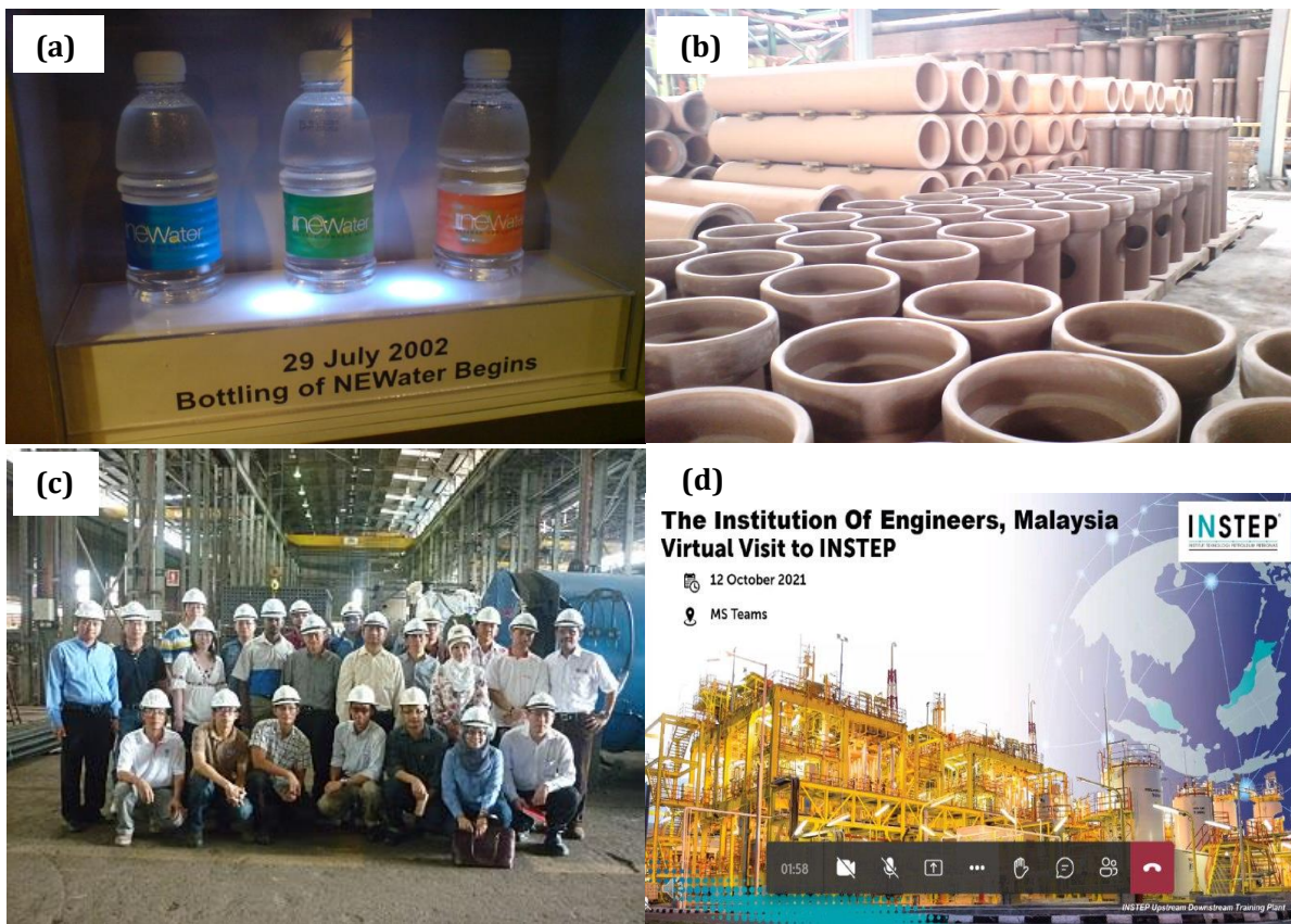
Figure 3: (a) Technical visit to Newater Facility, Singapore in 2008; (b) Clay pipes products from the technical visit to Claytan Group in Air Hitam, Johor in 2008 (c) Technical visit to Mechmar Boiler company in Pasir Gudang, Johor in 2012 (d) INSTEP Virtual visit, Terengganu in 2021.

Reflecting on my professional development expedition to be a professional engineer, it can be concluded that there are plenty occasions and factors that serves as a training process in developing and shaping me to the state I am now. Upon seeing the past experiences with new eyes, I realized that multiple theories can be deeply associated with specific scenario. The integration of the contributing theories will be my focus on future narrative analysis and self-study. The narrative of my journey above also teaches us that the journey of a person’s professional development is unique and personal.